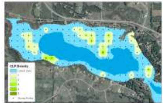
Lake Sarah West Daily Leaf Pondweed Density 6-8-2012

On behalf of the Water Quality Committee, we want to personally thank you for your support of our lake wide CLP treatment efforts!