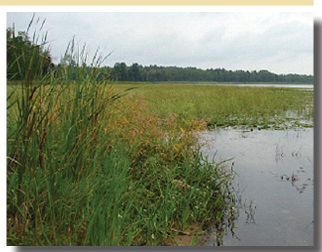
The removal or destruction of aquatic plants is a regulated activity under the DNR Aquatic Plant Management Program. If your shoreline plans include removal of aquatic vegetation, please contact a regional DNR Fisheries office because a permit may be required. Removal of native plants may provide open space for invasive species to take hold.

If the dock is designed and used for access to navigable water depth, a ope DNR permit will rarely be needed. A dock does not need a permit if it is no more than 8 feet wide, is designed to simply meet the need of reaching navigable depths, and follows the other guidelines on the front of this brochure.